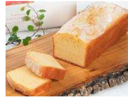
Milk pound cake

Kneading condensed milk into the dough creates a milky sweet taste.