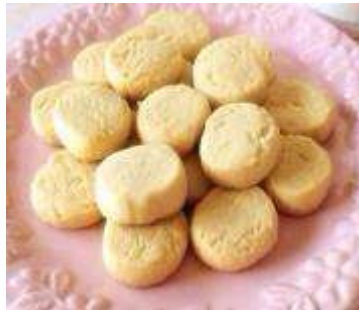
Condensed milk cookie

Egg-free. But rich enough due to milky creamy flavor from condensed milk!