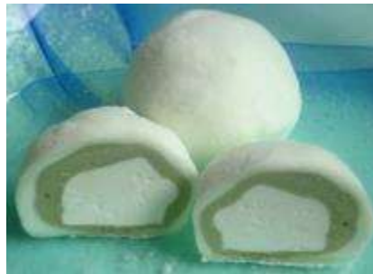
Matcha cream daifuku

A new taste of condensed milk cream. The matcha filling and condensed milk cream go very well together.