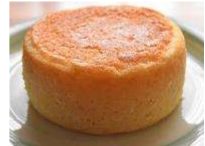
Condensed milk cake

A fluffy condensed milk-flavored cake. You can even make it in a rice cooker by mixing the ingredients! Simple recipe!